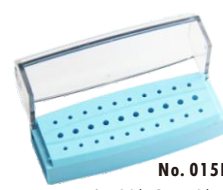
No. 015D for 20*FG + 10*RA