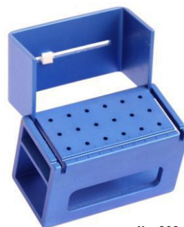
No. 202 for Root canal files * 18