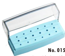
No. 015C for 12*FG + 6*RA