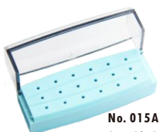
No. 015A for 18*FG