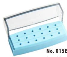
No. 015E for 18*RA