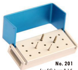
No. 201 for FG burs * 15