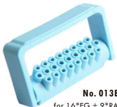
No. 013E for 16*FG + 9*RA