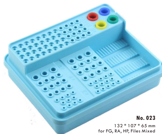
No. 023 132 * 107 * 65 mm for FG, RA, HP, Files Mixed