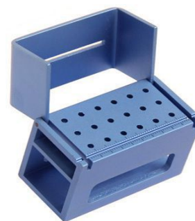
No. 212 For HP burs * 18