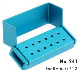
No. 241 for RA burs *12