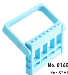
No. 016B for 8*HP