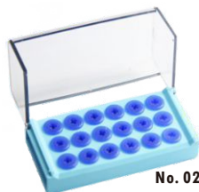
No. 022D for 18*RA