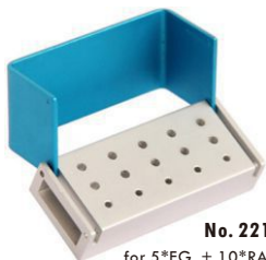
No. 221 for 5*FG + 10*RA